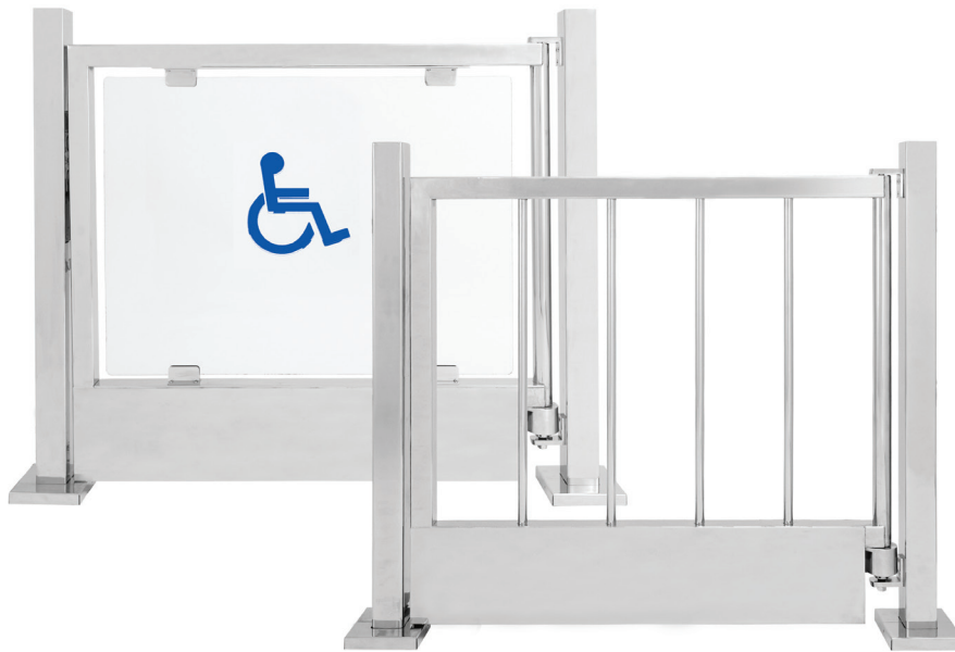
(VSGX-1 model shown with acrylic panel and with steel infill bars)

VSG gates are ideal for use in providing special needs access or material delivery. Gates can be installed alone or used in conjunction with turnstiles and/or railing.